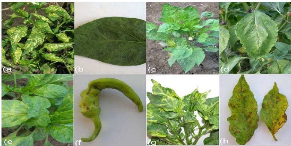
Figure 1. Symptoms of virus infection on pepper: a) Yellowing (AMV), b) Mosaic (PMMoV), c) Mild mosaic and leaf distortion (CMV), d) Mottling (PVY), e) Mosaic and leaf distortion (CMV+AMV), f) Deformations and necrosis of fruit (PVY+CMV), g) Severe yellowing and leaf distortion (PVY+AMV), h) Necrotic spots (PVY+CMV)

Plants can display virus-like symptoms when plants respond to unfavorable weather, nutritional imbalances, infection by other types of pathogens, damage caused by pests or abiotic agents and other factors (van der Want and Dijkstra 2006); therefore the symptoms caused by the viruses have no diagnostic significance.