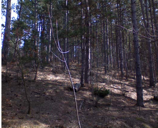
Figure.2. Plantation with care practices on good land.

The examples above show two extremes i.e. plantation on good soil with care practices and plantation without care practices on poor soil.