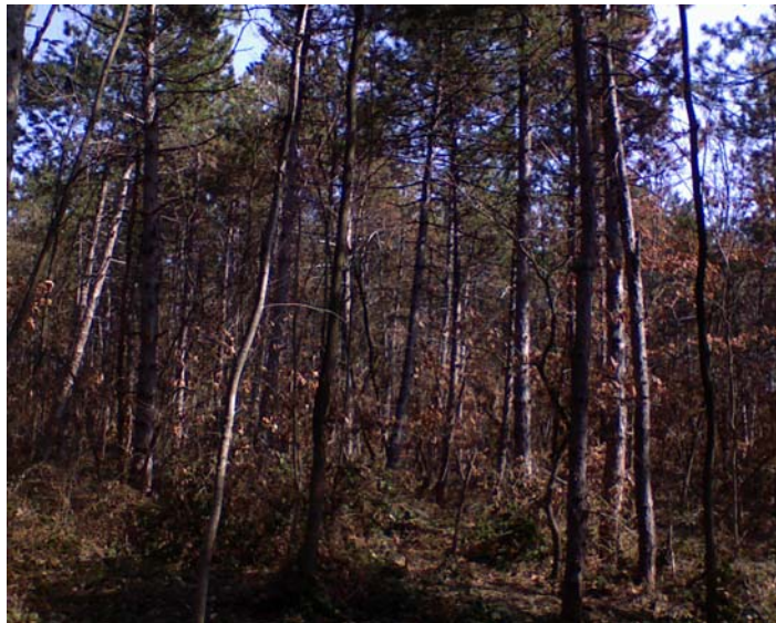
Figure.1. Plantation without care practices on poor soil.

Tables show comparison between plantations cultivated on land i.e. on a eutric brown soil with good properties and plantations without care practices (no cropping-thinning) cultivated on the worst land i.e. shallow humus silicate land .